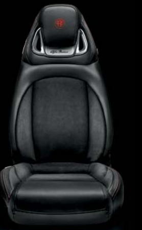
Leather and Alcantara® 323 Black (standard)