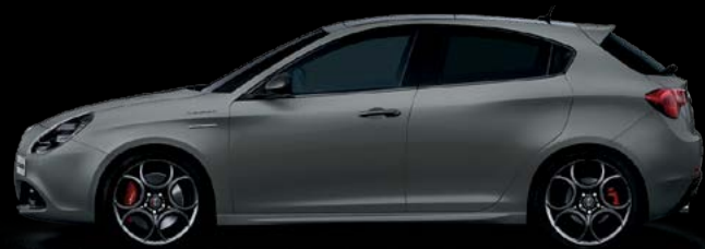
529 Magnesio Grey