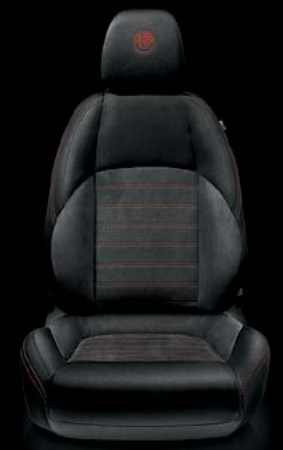
Fabric and Alcantara® 308 Black-Light Grey (standard)