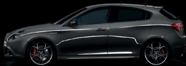
409 Lipari Grey