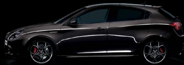
805 Etna Black