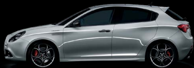
620 Silverstone Grey