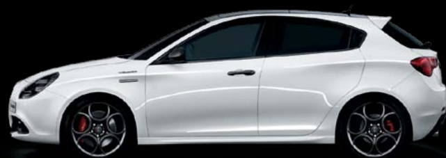
217 Alfa White