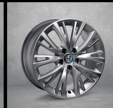
74B 17" spoke alloy rims with 225/45 tyres (standard on Super TCT)