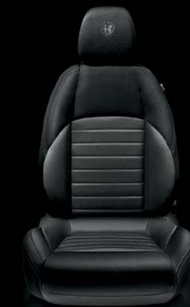
Two-colour fabric 123 Nero-Dark Grey (standard)