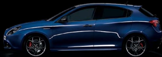
486 Anodizzato Blue