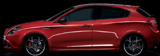
414 Alfa Red