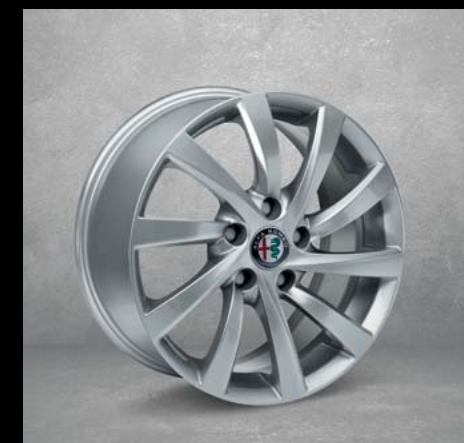
431 16" turbine alloy rims with 205/55 tyres (standard on Super manual)