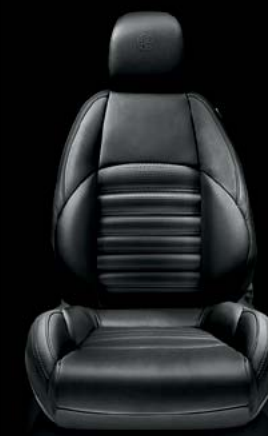
Leather 408 Black (Opt on TCT only)