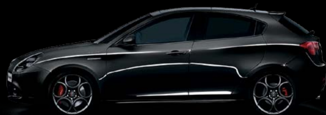
601 Alfa Black