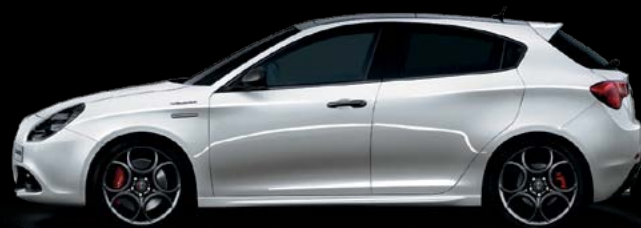
764 Perla Moonlight