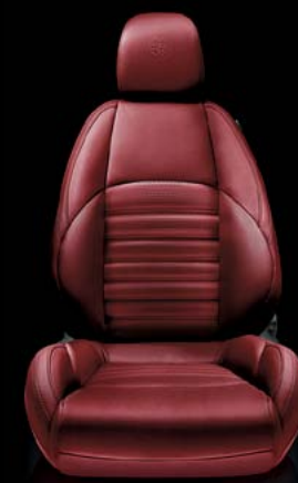
Leather 401 Red (Opt on TCT only)