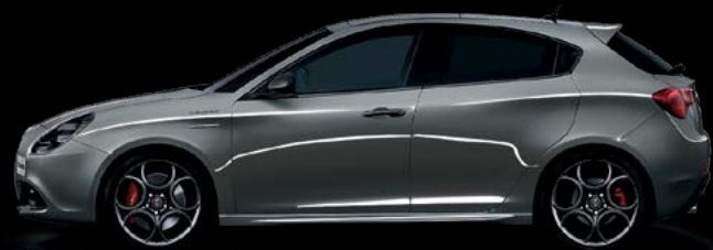
318 Stromboli Grey