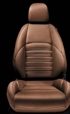
Leather 465 Tobacco (Opt on TCT only)