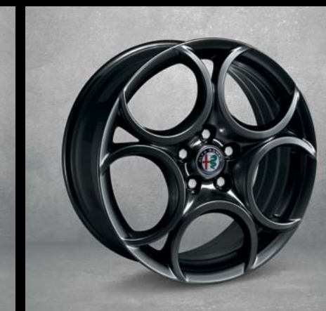
5FB 18" black five-hole alloy rims with 225/45 tyres (optional on Veloce and linked to Veloce pack)