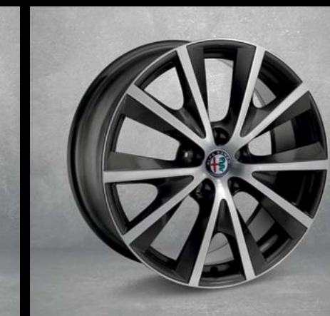
7HP 18" spoke chrome/burnished alloy rims with 225/40 tyres (standard on Veloce)