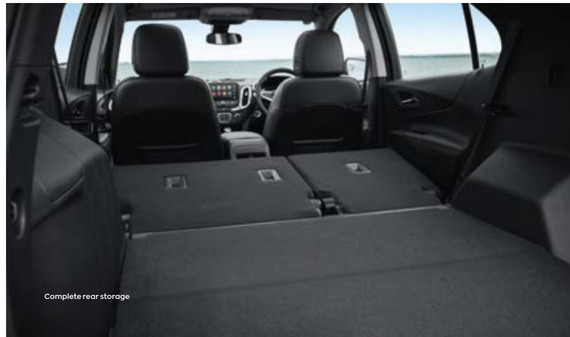
Complete rear storage