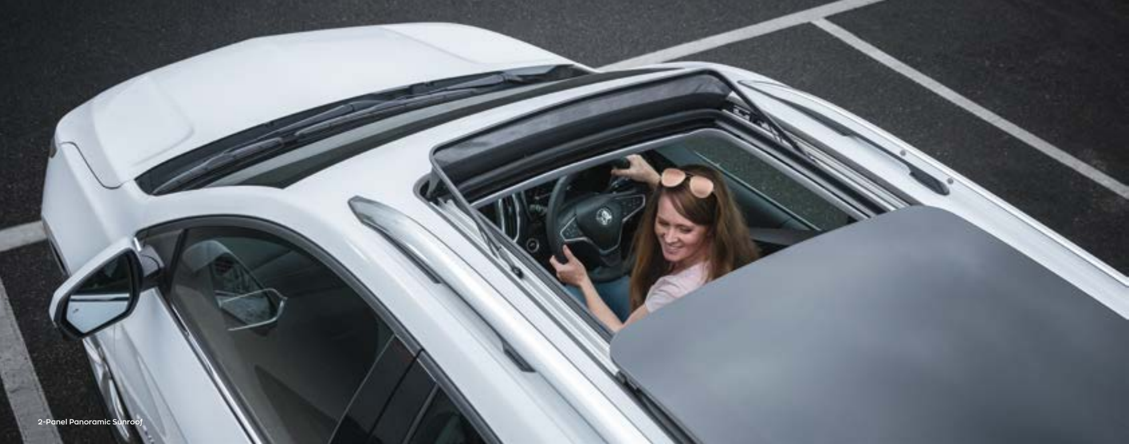
2-Panel Panoramic Sunroof