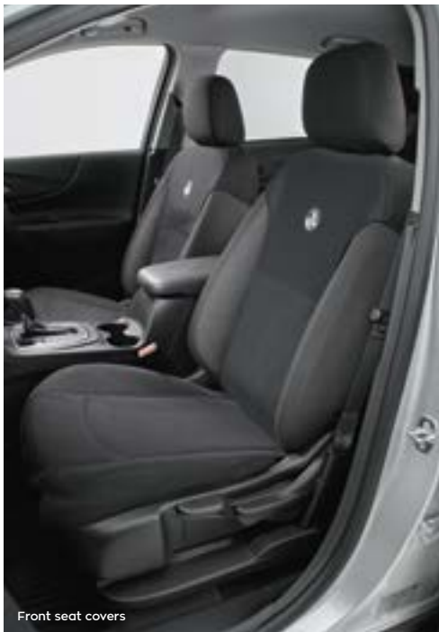
Front seat covers