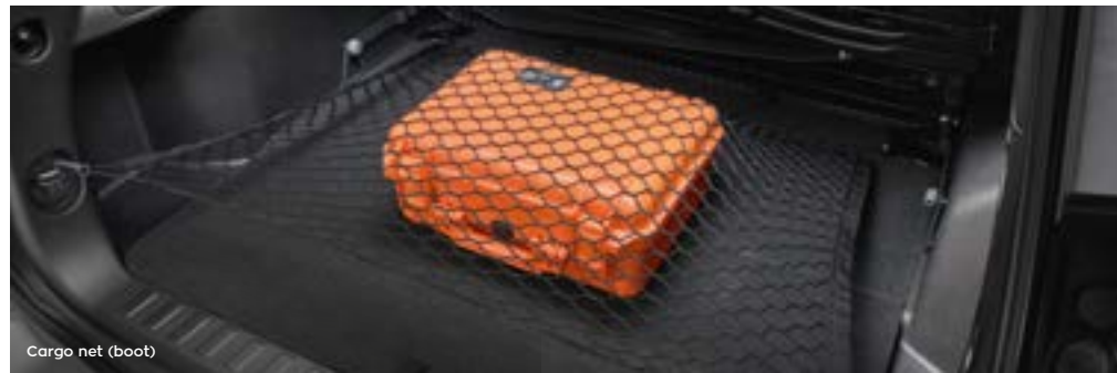
Cargo net (boot)