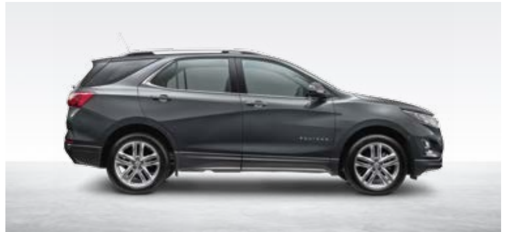
Son of a Gun Grey