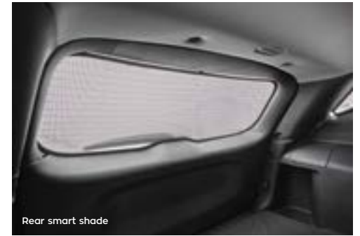
Rear smart shade