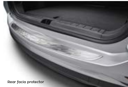
Rear fascia protector