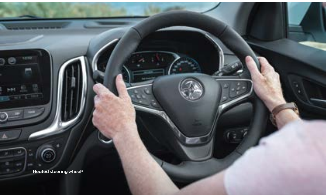
Heated steering wheel 2