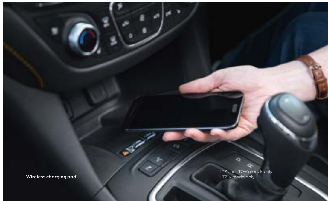
Wireless charging pad 1