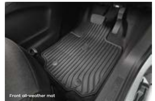
Front all-weather mat