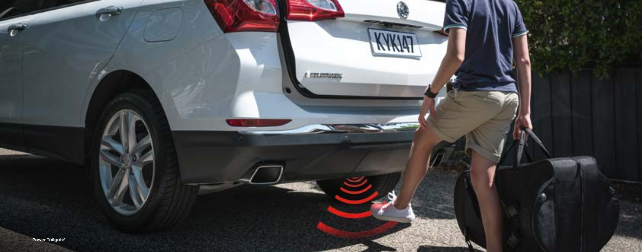
Power Tailgate 1