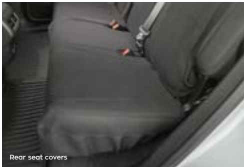
Rear seat covers