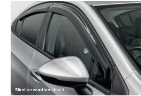
Slimline weather shield