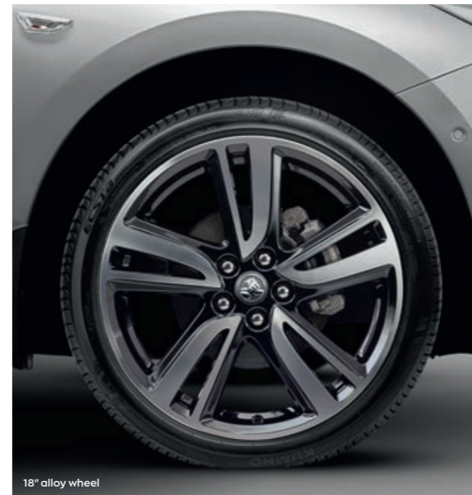
18" alloy wheel