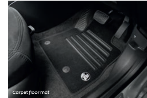
Carpet floor mat