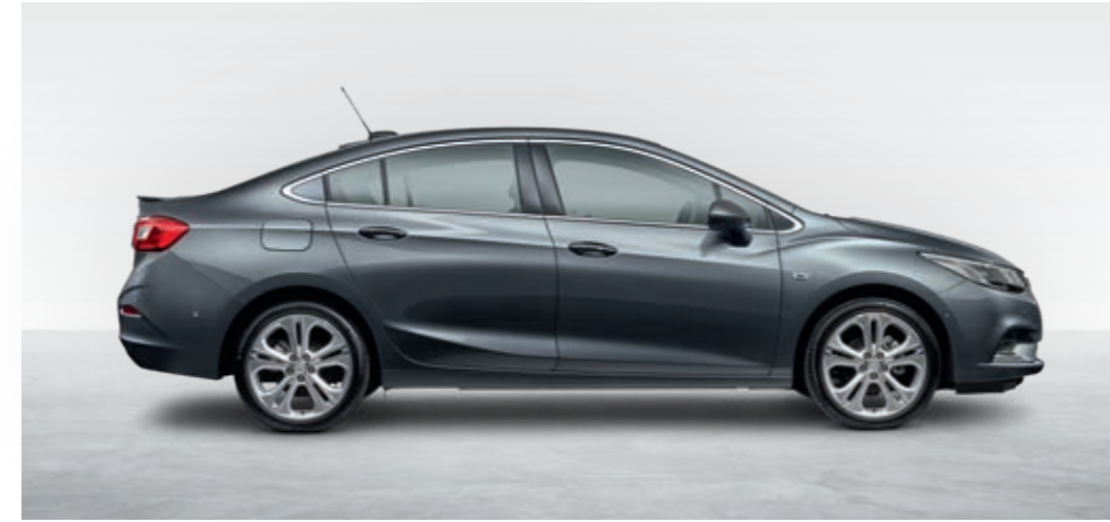
Satin Steel Grey