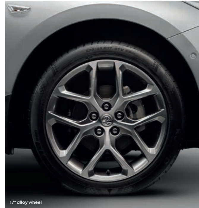
17" alloy wheel