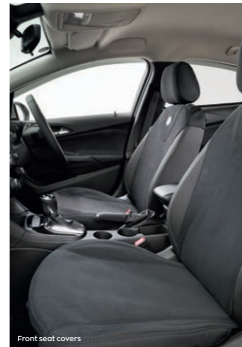
Front seat covers