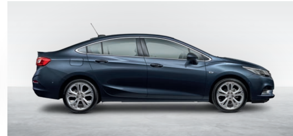
Old Blue Eyes