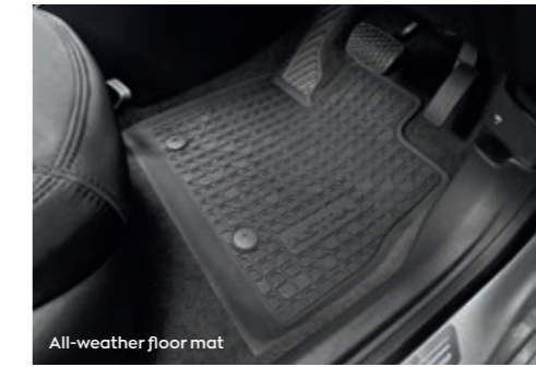
All-weather floor mat