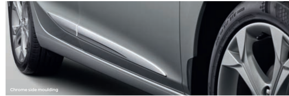
Chrome side moulding