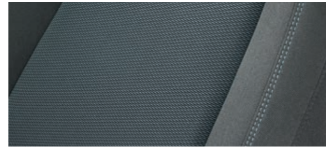
Jet Black cloth trim

*Prestige paints are available at an additional cost and certain colours may not be available from time to time. Variations between colours shown and actual paint colours/interior trim colours may occur due to the printing process. Actual vehicle colours may appear different under certain light conditions. Trim patterns are not to scale. Indicative only. Customers are encouraged to contact their Holden Dealer for current colour availability.