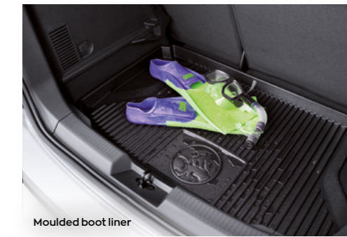
Moulded boot liner