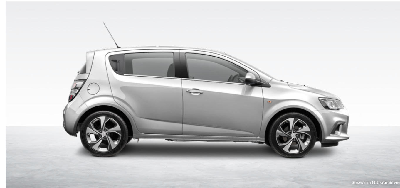
Shown in Nitrate Silver