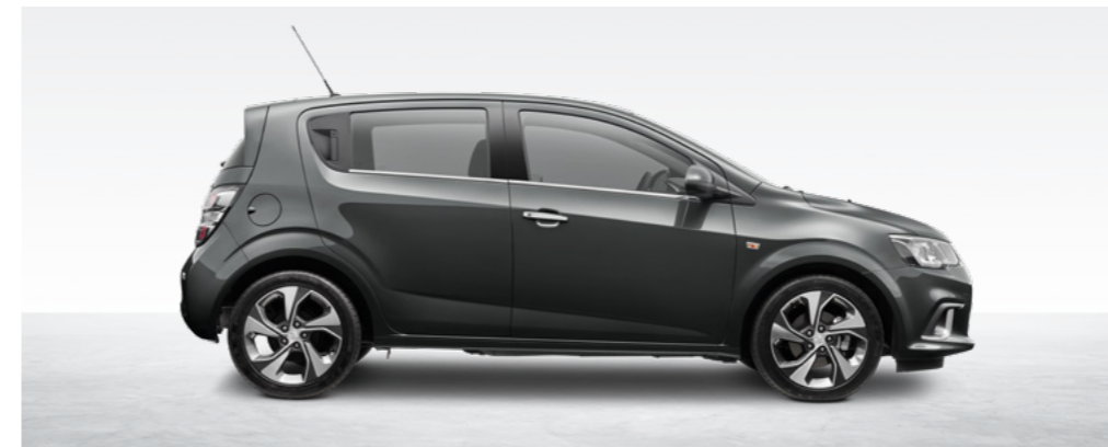
Son of a Gun Grey*