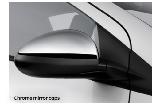
Chrome mirror caps