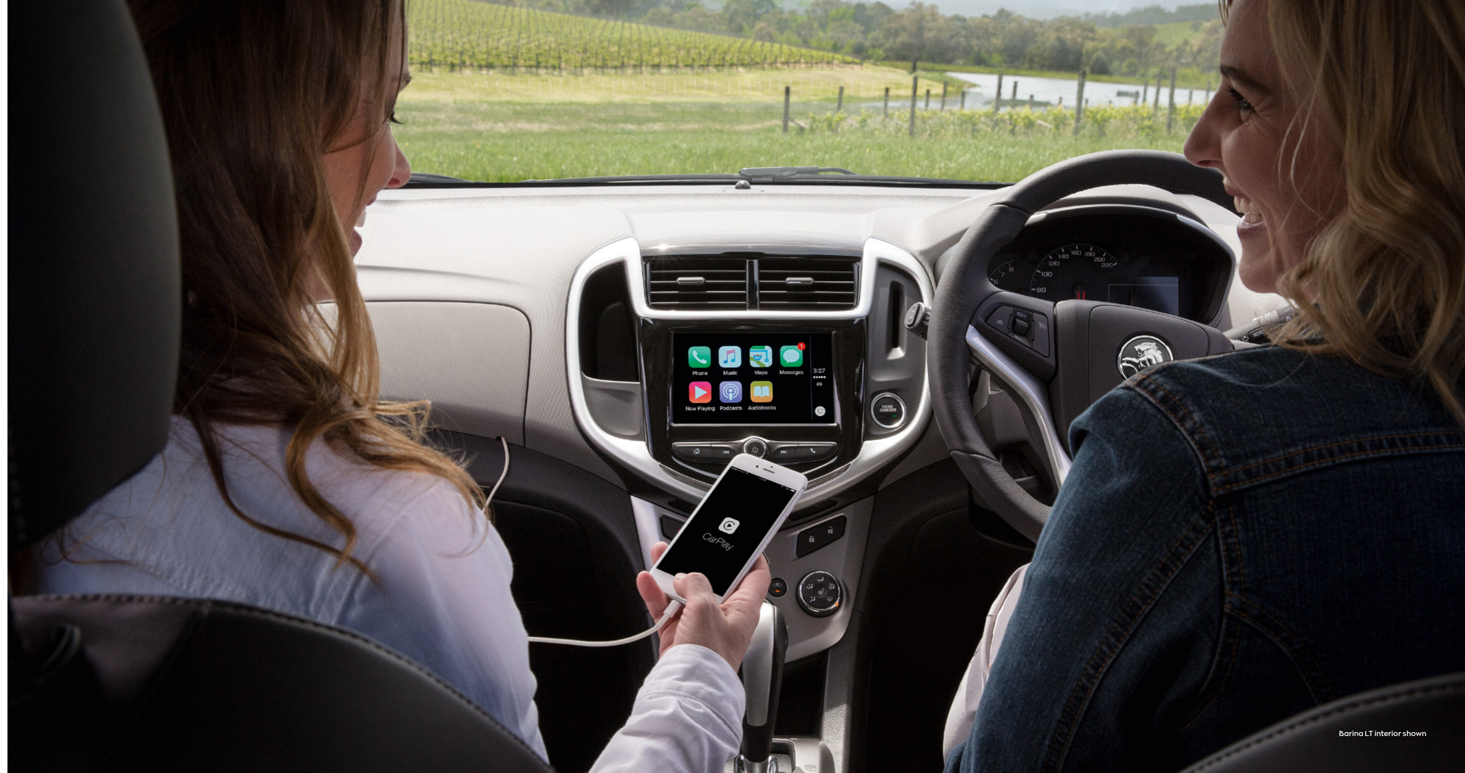
Barina LT interior shown

2 Requires compatible iOS device. See apple.com.au for details. 3 Requires compatible Android ® device. See android.com for details.