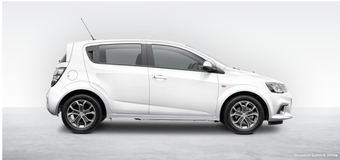
Shown in Summit White