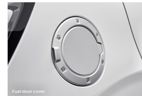
Fuel door cover