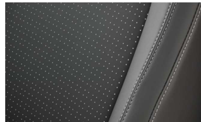
Jet Black Sportec